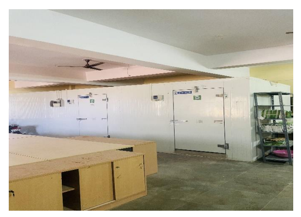
Cold Stores (3) at CoE, Jaisalmer