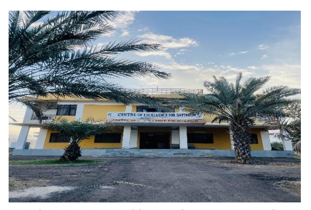
Administrative Building and Farmers Hostel