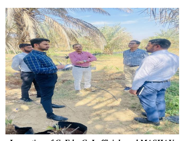
Inspection of CoE by GoI officials and MASHAV