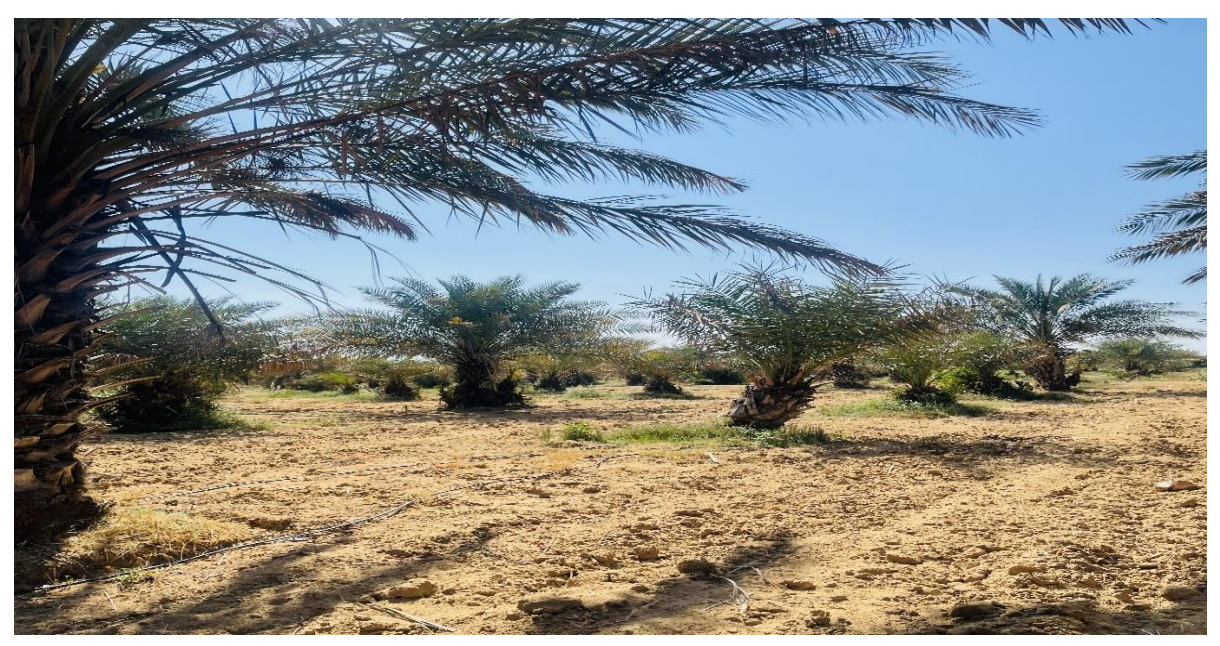
Site proposed for establishment of Demonstration Block (5 ha) wherein already established plantations show growth variations