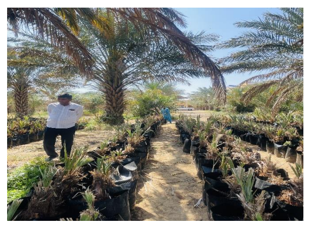
Nursery Production in Open Conditions at CoE