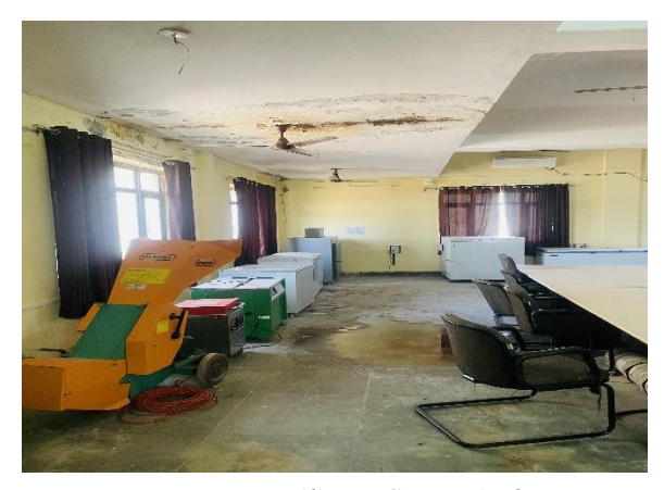
Post-Harvest Facility at CoE, Jaisalmer