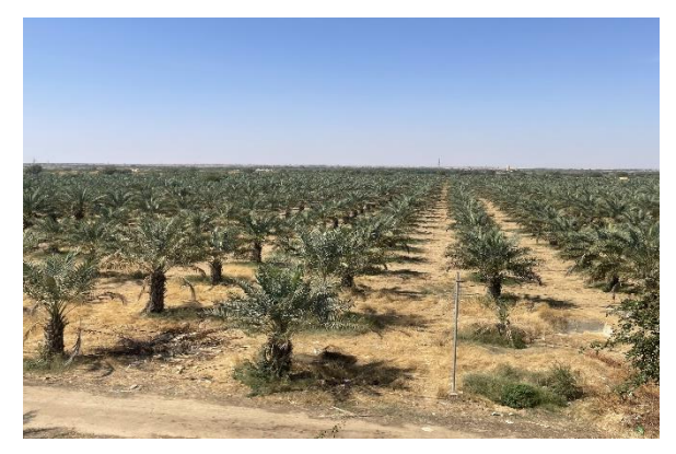
Date Palm Plantation at CoE (Approx. 90 ha)